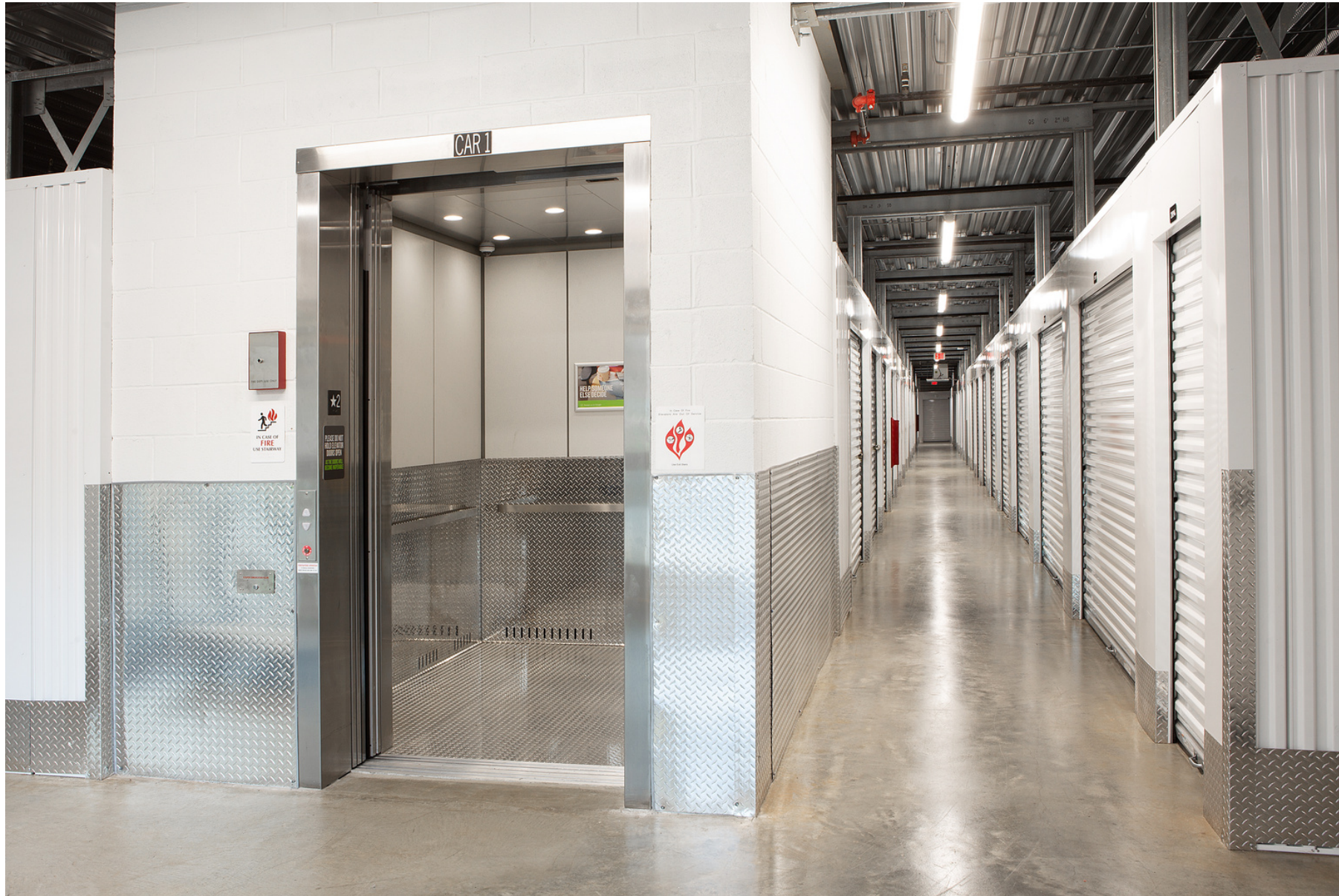
721 climate-controlled units | 108,759 square feet