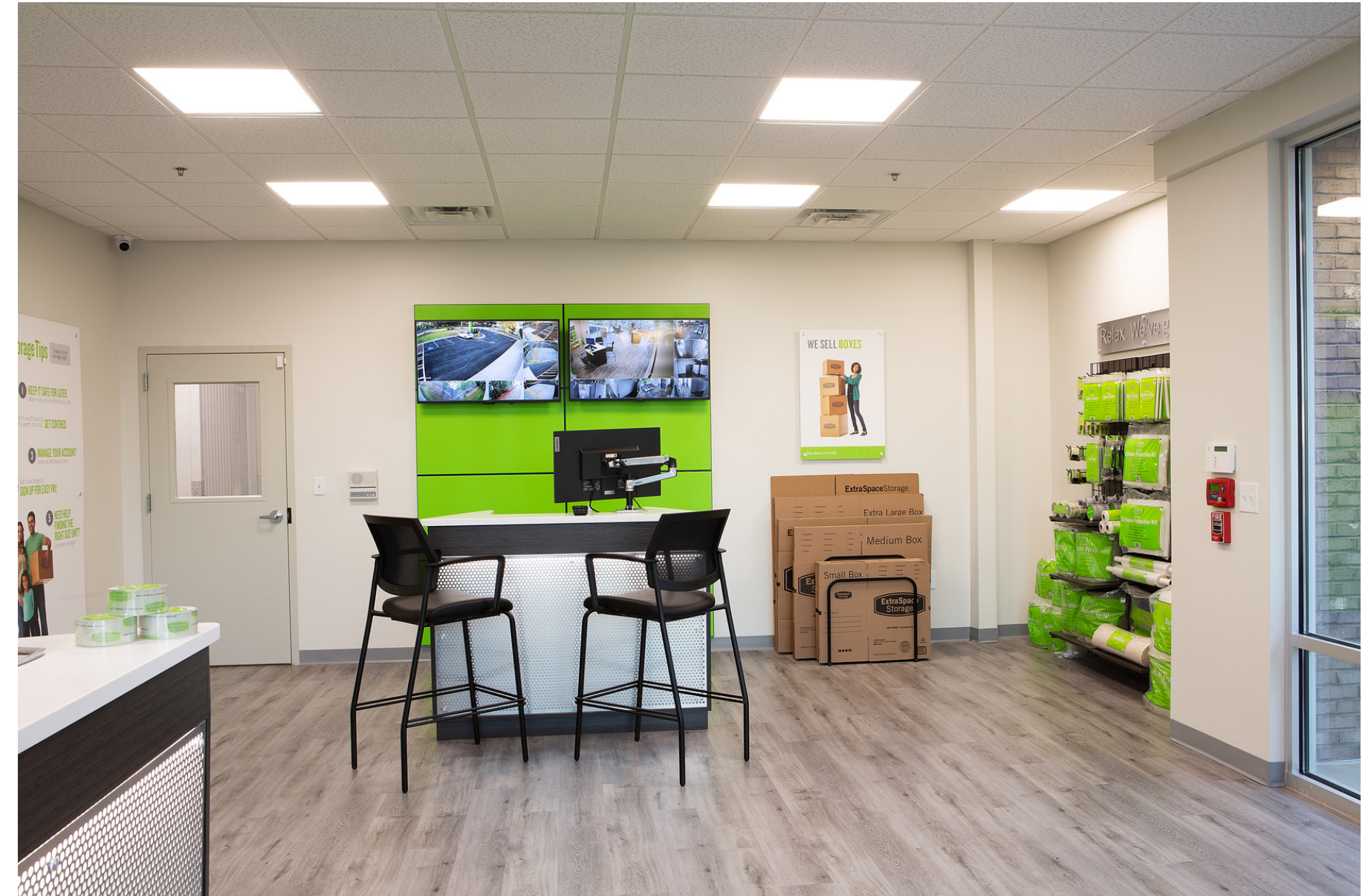
Storefront complete with modern finishes