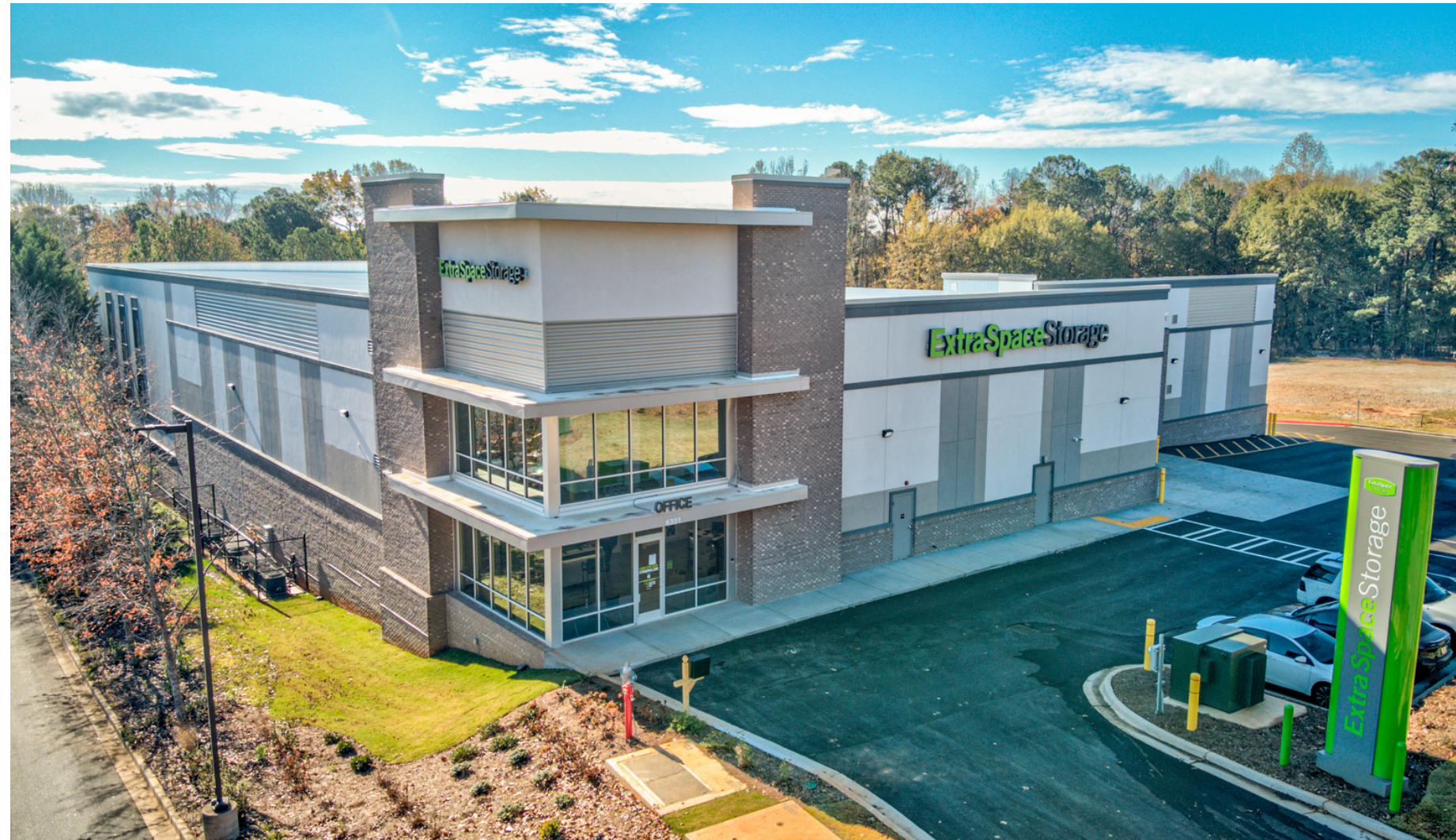
The facade of this facility includes EIFS, metal and brick