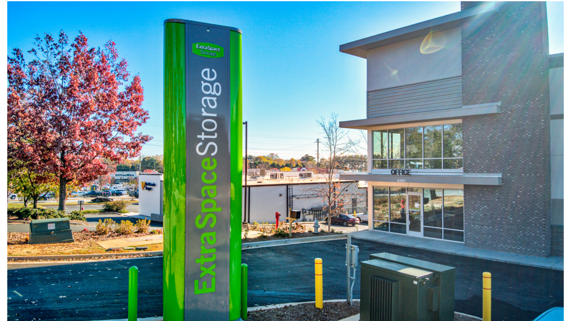
Storefront with wraparound windows